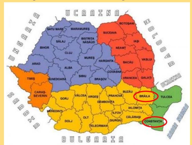
Map 3: Braila and Constanta regions, Romania.