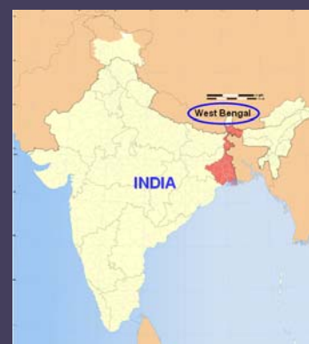
Map 1. West Bengal, India.