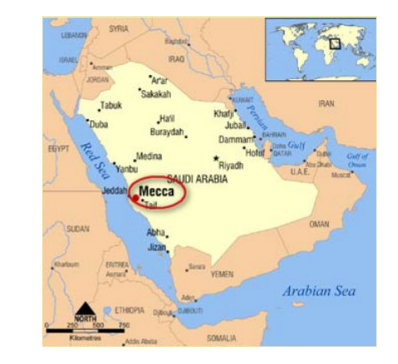
Fig. 1. Mecca, Saudi Arabia

Pilgrims can also go to Mecca to perform the rituals at other times of the year. This is sometimes called the "lesser pilgrimage", or Umrah. It is most frequently performed during the month of Ramadan that took place from 9 July to 8 August this year.