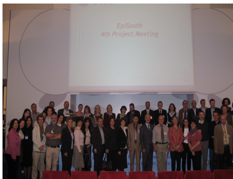
EpiSouth Meeting, Rome, 2010

The new phase implies a shift of the Network's activities to a wider approach. Building on the knowledge of regional gaps and needs identified during the first EpiSouth implementation in the fields of Epidemic Intelligence, Vaccine Preventable Diseases and Migrants, Cross Border Emerging Zoonoses and Training in field/applied epidemiology, the new EpiSouth Plus Project aims at contributing to the control of public health threats and other bio-security risks in the Mediterranean region and South-East Europe.